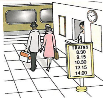
There's a train at 10.30.