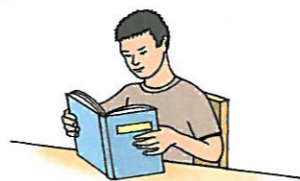
I like this book. It's interesting. (it = this book)