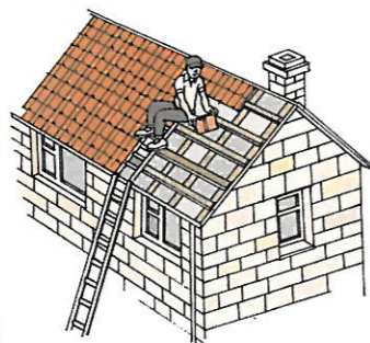
There's a man on the roof.