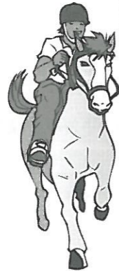
c horse riding