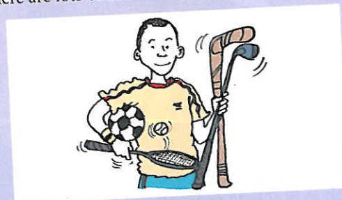
What sport? (Tennis or golf or football or hockey or ...?)

We use what when there is a wide choice of possible answers. We ask What sport? because there are lots of different sports.