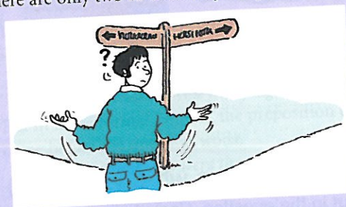
Which way? (Right or left?)

We use which when there is a limited number of possible answers. We ask Which way? because there are only two or three ways to go.