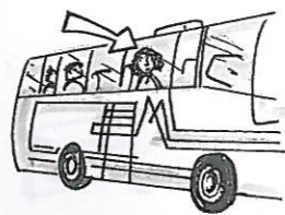
on a bus