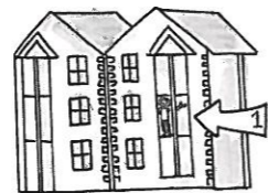
on the first floor