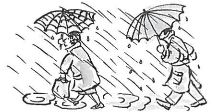
It's raining heavily .