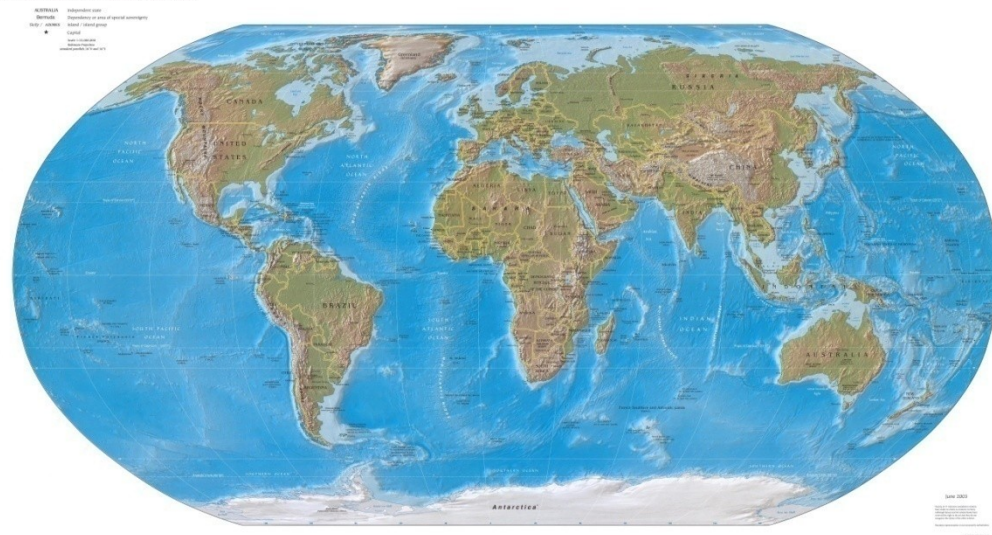
Physical Map of the World, June 2003