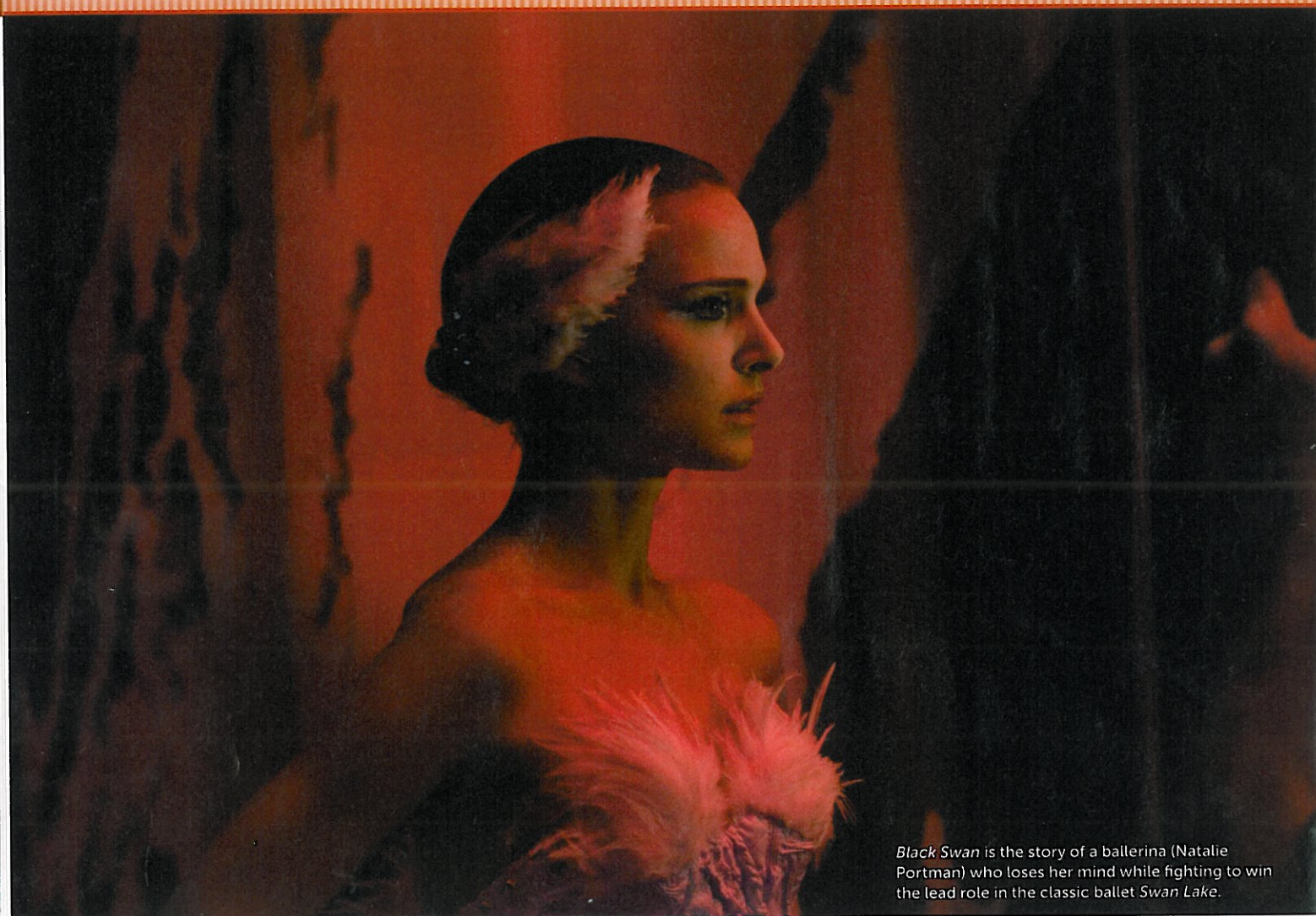
Black Swan is the story of a ballerina (Natalie Portman) who loses her mind while fighting to win the lead role in the classic ballet Swan Lake .