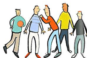
a gang of youths/ kids/teenagers