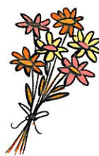
a bunch of flowers