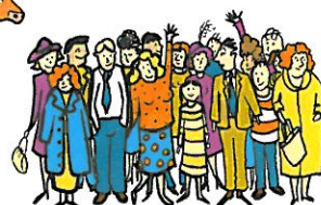
a group of people