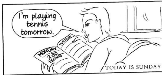
He is playing tennis tomorrow.